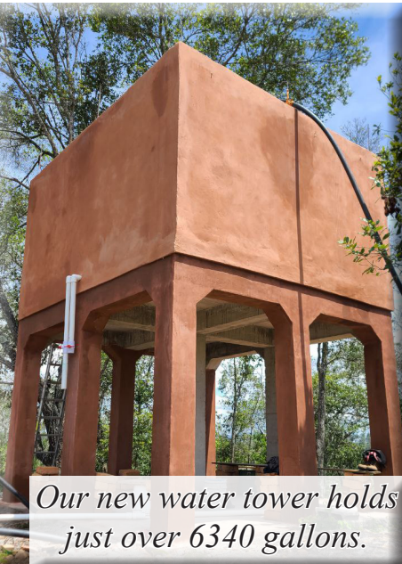
Our new water tower holds just over 6340 gallons.

with covid, it hasn't completed until now. With more camps and camp-outs each year and bigger day events, the four toilets, four showers and as many sinks will come in handy. Each side will come equipped with a place to wash clothes for the longer camp-outs.