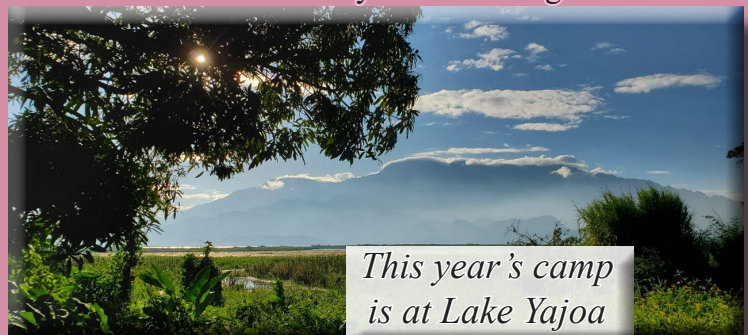
This year's camp is at Lake Yajoa