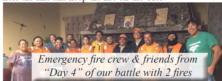
Emergency fire crew & friends from "Day 4" of our battle with 2 fires

F orest fires threaten Honduras every dry season. This year we had two big fires threaten the CRC property in the same week. From Monday to Thursday the fires attacked the CRC on three sides. With God's blessing and the help of many friends we managed to hold the line and keep the fire off the CRC.