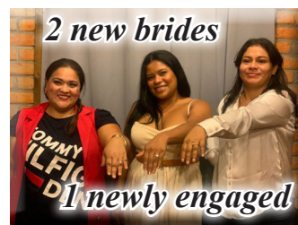
2 new brides